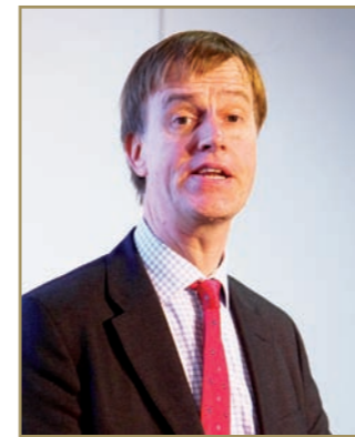
The Rt Hon Stephen Timms MP, Financial Secretary to HM Treasury presenting the 2008 Awards.

Award winners included: Delice de France, Mace Ltd, Clydesdale Bank, Henderson Group, Donor Strategy and Barclays. A number of organisations that did not win categories received highly commended certificates as the quality of their applications was so high.