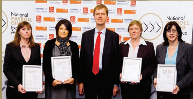
The Rt Hon Stephen Timms MP, Financial Secretary to HM Treasury presenting the Highly Commended Awards at the 2008 ceremony