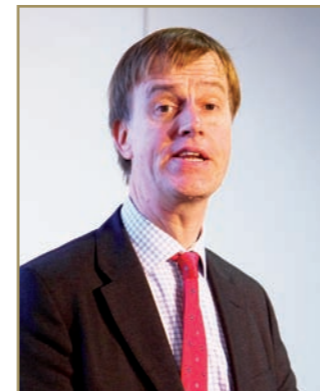
The Rt Hon Stephen Timms MP, Financial Secretary to HM Treasury presenting the 2008 Awards.

Award winners included: Delice de France, Mace Ltd, Clydesdale Bank, Henderson Group, Donor Strategy and Barclays. A number of organisations that did not win categories received highly commended certificates as the quality of their applications was so high.